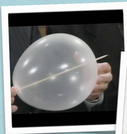
The secret ingredient is using a wooden dowel that's been soaked in a little dish soap.

✱ It's possible to puncture a balloon with a sharp wooden skewer without it popping! Using the secret ingredient below, carefully, insert the skewer into a thick part of the latex.