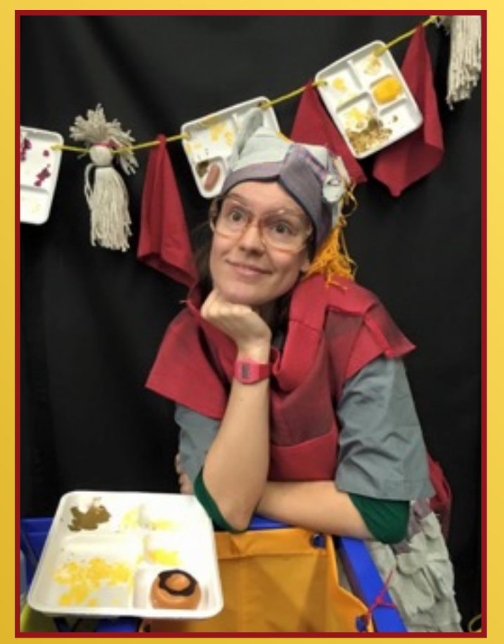
Bright Star's Cinderella dressed in rags, wishing that her circumstances could one day change and wondering what her life could look like if she could go to the Prince's Fairy-tale Ball!

This imaginative production brings to life the classic, fairy tale story of Cinderella in a brand new way that will surprise and delight audiences. The wacky Bright Star duo, Dustmop and Binny, "accidentally" stumble upon an audience. Before you know it, they decide to put on a play with what they have before them. Using household items, recycled objects and physical comedy, our performers create inventive settings and lively scenes with all of your favorite characters, such as the ugly Step-Sisters, the evil Step-Mother, Prince Charming, and the bubbly Fairy God Mother. This 45 minute production of Upcycled Cinderella is bound to activate the imagination! We hope that we encourage young audiences to use teamwork, friendship, creativity and the value of recycling in their every day lives.