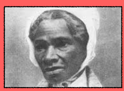
SOJOURNER TRUTH: In 1851 her speech 'Ain't I a Woman? ' was given at the Women's Convention in Akron. Born into slavery in 1791, Ms. Truth was one of the most powerful advocates for human rights in the 19th century.