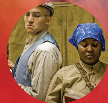
Follow Harriet Tubman and many others on their difficult journeys with Heroes of the Underground Railroad . (Grades 3-8)