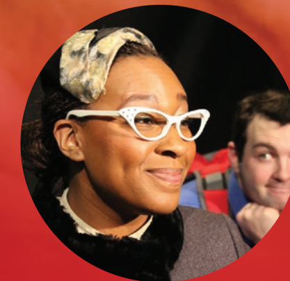
Rosa Parks and Friends features some of Black History's most courageous heroes. (Grades K-5)