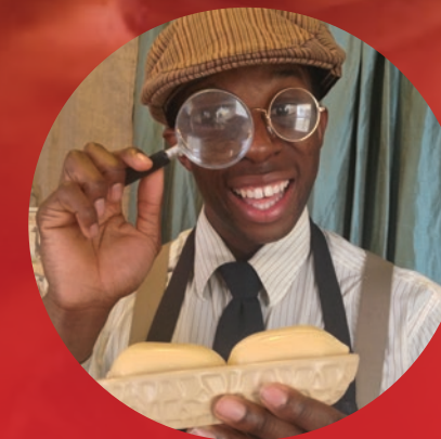
Meet scientists, inventors and leaders with George Washington Carver and Friends . (Grades K-5)

Black History is American History...and so much more. Bright Star Touring Theatre is committed to bringing the inspiring and difficult stories of Black History to light through our Black History shows. From shows like African Folktales which are perfect for very young audiences, to programs like Let It Shine: The American Civil Rights Movement 1955-68 , Black History shows are at the heart of our mission - to challenge, educate and delight audiences across the country. Join us in celebrating Black History during our 2021-22 season!