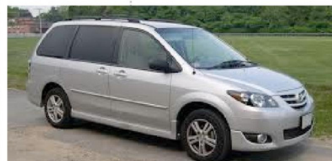
We travel the country in mini vans!