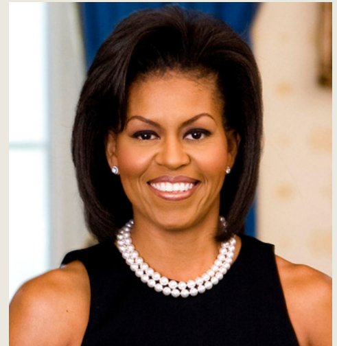
L-R: Ella Fitzgerald, Sojourner Truth, Michelle Obama