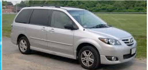
We travel the country in mini vans!