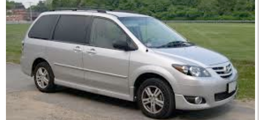
We travel the country in mini vans!